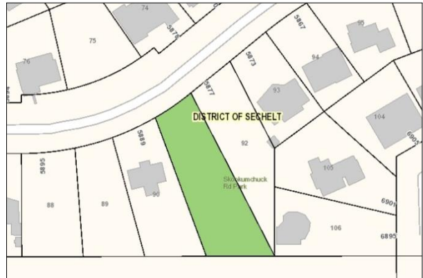
OPTION 2: SKOOKUMCHUK PARK