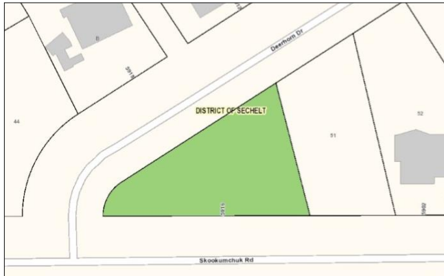
OPTION 1: TOT PARK

Possible solutions are to; do nothing or form a committee to come up with a plan to present to the community.